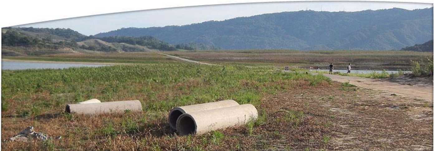
DROUGHT AT LAKE CASITAS